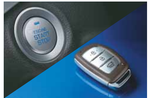
Smart Key and Push Button Start/Stop