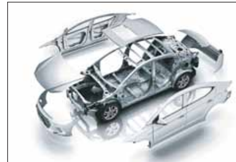
Strong Structure with 53% Advanced High Strength Steel