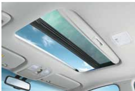
Smart Electric Sunroof