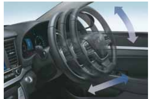
Tilt & Telescopic Steering