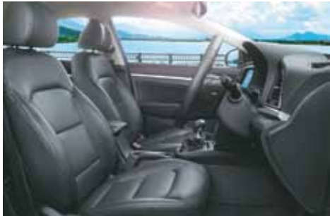
Premium Black Interiors with Leather* Seats