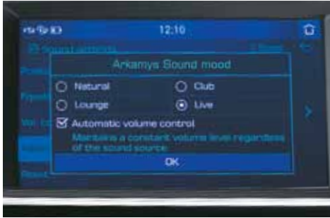
Arkamys Sound Mood