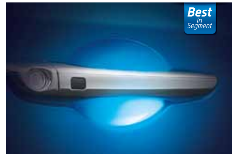
Chrome Door Handle with Pocket Light