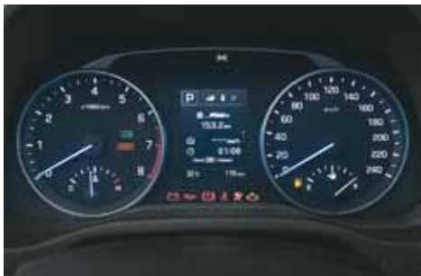
Advanced Supervision Cluster with Large 3.5 mono TFT Screen