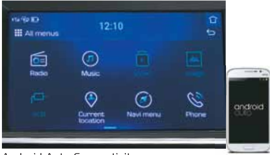
Android Auto Connectivity