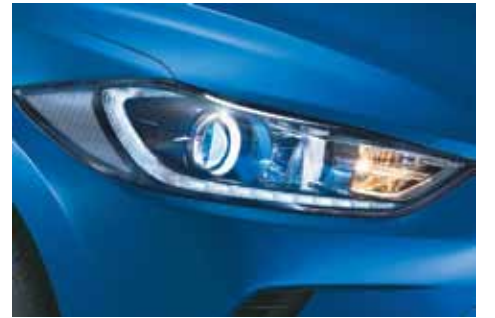
HID Headlamps with LED DRL