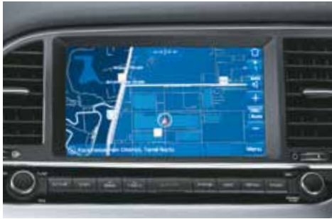
8.0 Smart Audio Video Navigation with Voice Recognition