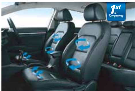
Front Seat Ventilation System