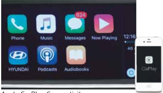
Apple CarPlay Connectivity