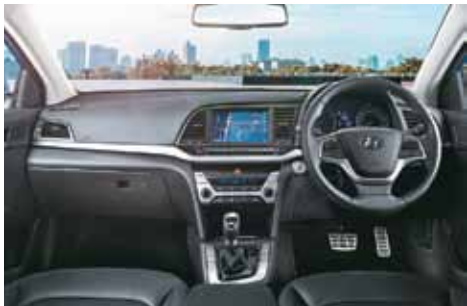
Driver Centric Ergonomic Design