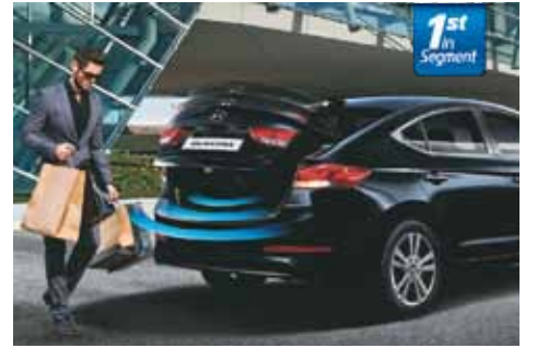
Hands Free Smart Trunk

Auto Defogger | Electro Chromic Mirror | USB Charger | Ski Pass Through