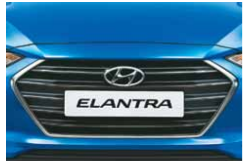
Imposing Chrome Grille