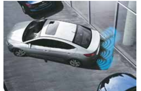
Rear Camera with 4 Parking Sensors