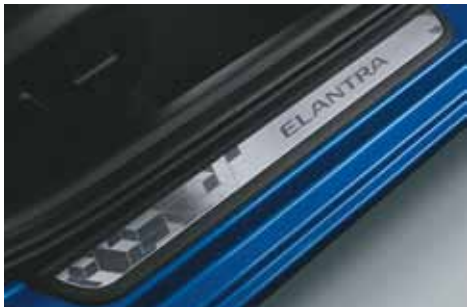
Premium Aluminium Scuff Plates