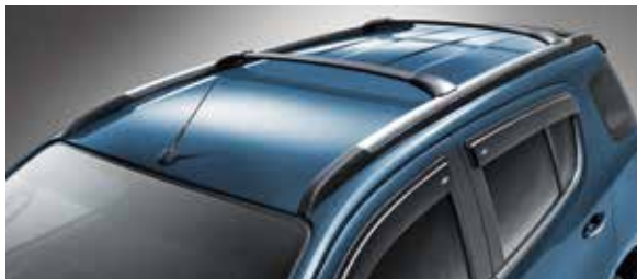
ROOF RACK CROSS RAIL