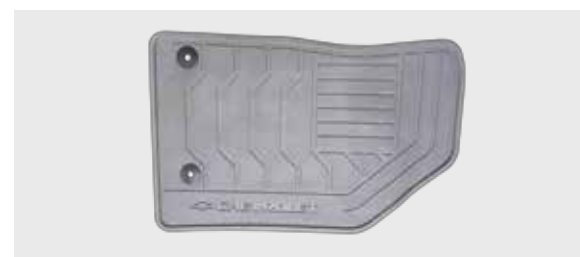
ALL WEATHER FOOTMAT