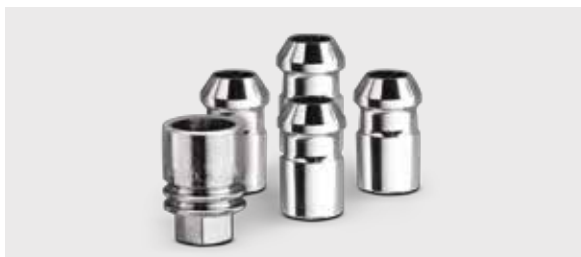
ANTI THEFT WHEEL LOCK