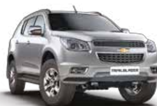
SWITCH BLADE SILVER