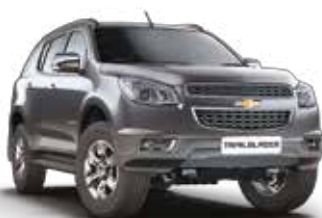
SATIN STEEL GREY